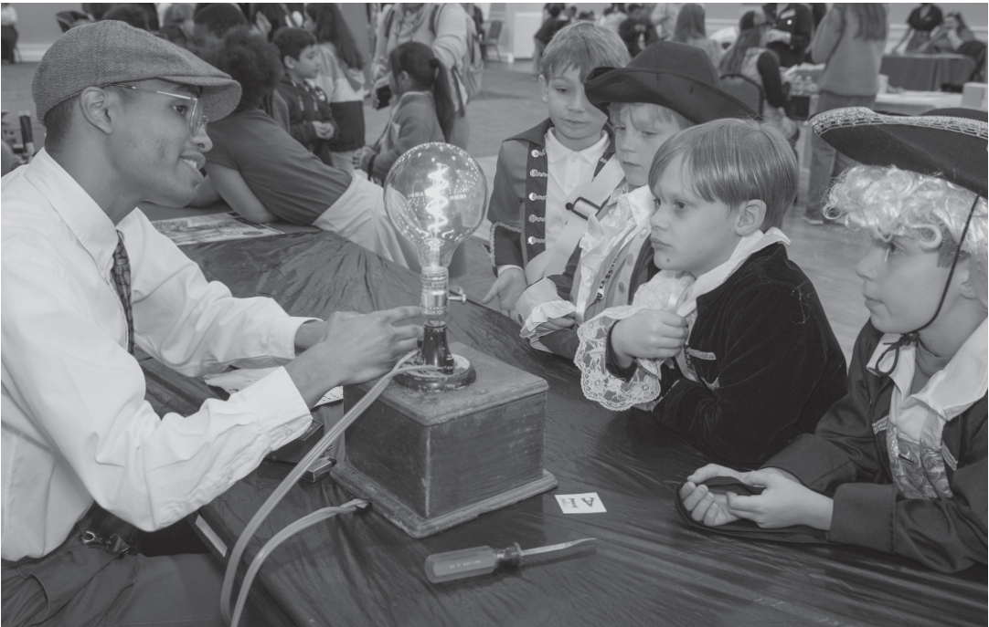
Costumed school children visit stations at the 2025 Georgia Day Expo.