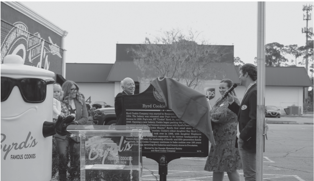
Top: A historical marker about the Vessel Kit Jones was dedicated on March 21, 2025, in McIntosh County. Bottom: A historical marker for Business History Initiative honoree Byrd Cookie Company was dedicated in Savannah on December 4, 2025.