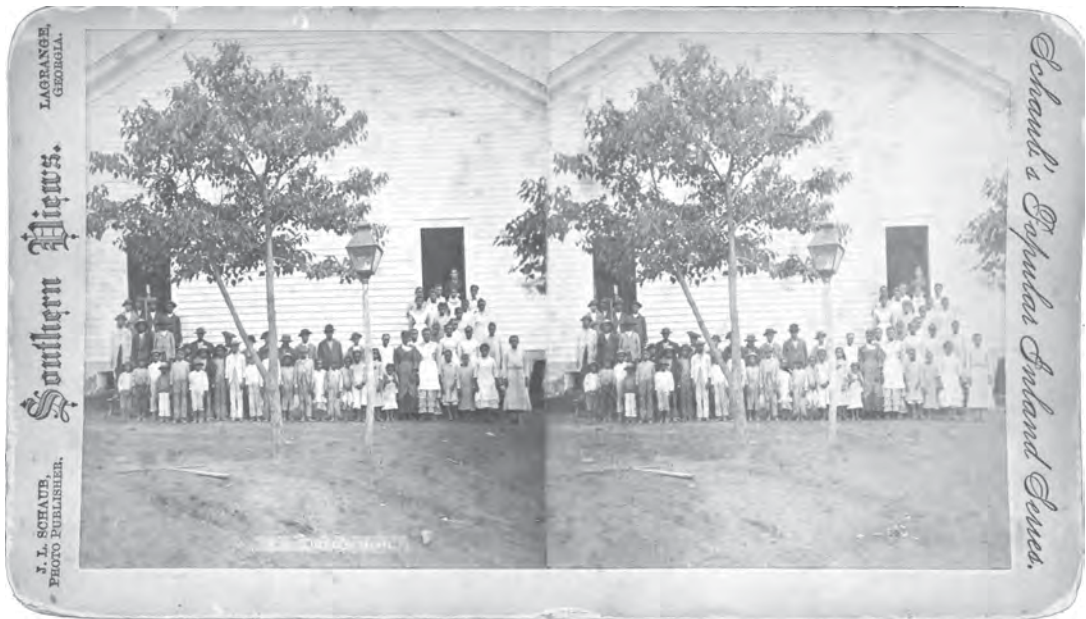
Top: Stereo card of Hurricane Falls in Tallulah Falls, Georgia, circa 1870s. Bottom: Stereo card of an African American school in Gainesville, Georgia, during Reconstruction. New acquisitions.