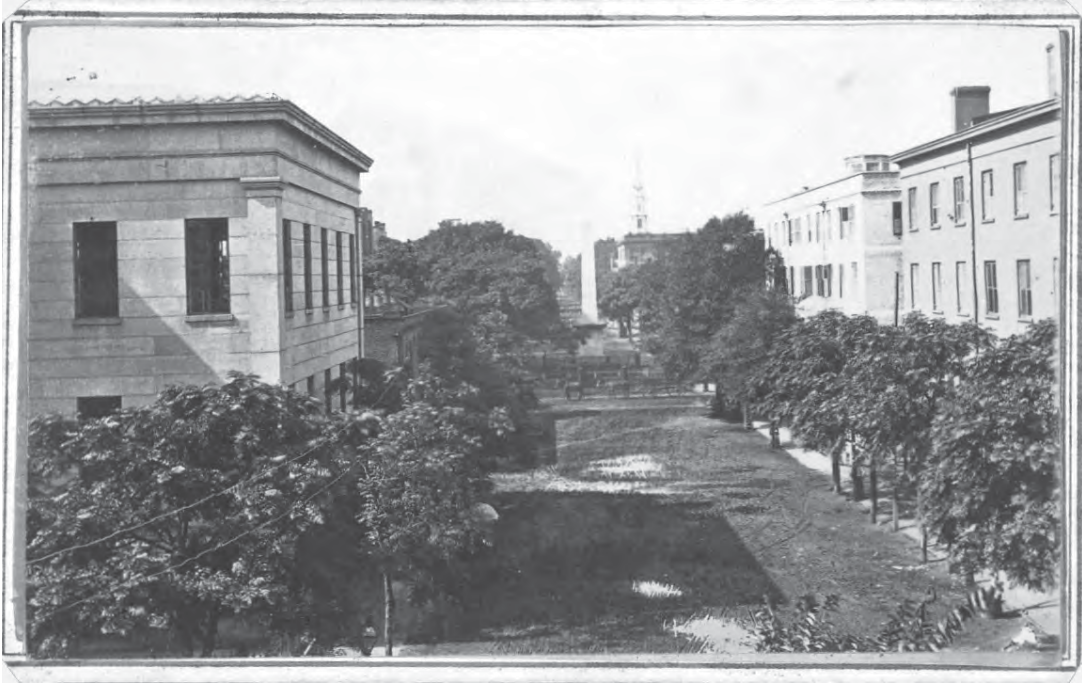
View of Bull Street in Savannah, Georgia, circa 1860s. Carte de visite. New acquisition.

future of democracy. GHS historians and educators delivered dozens of public presentations across the state and beyond, equipping leaders with a better understanding of our past to inform future decisions.