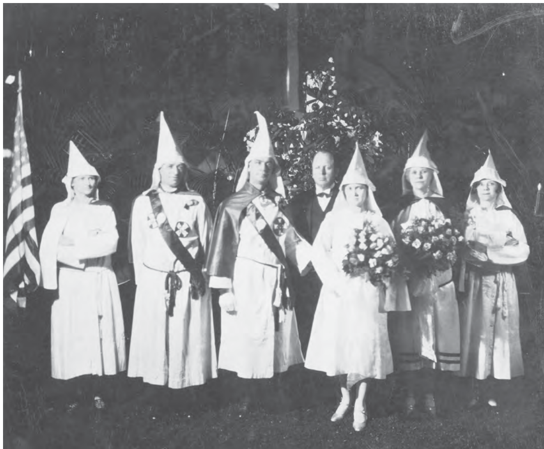
Ku Klux Klan wedding, undated. New acquisition.