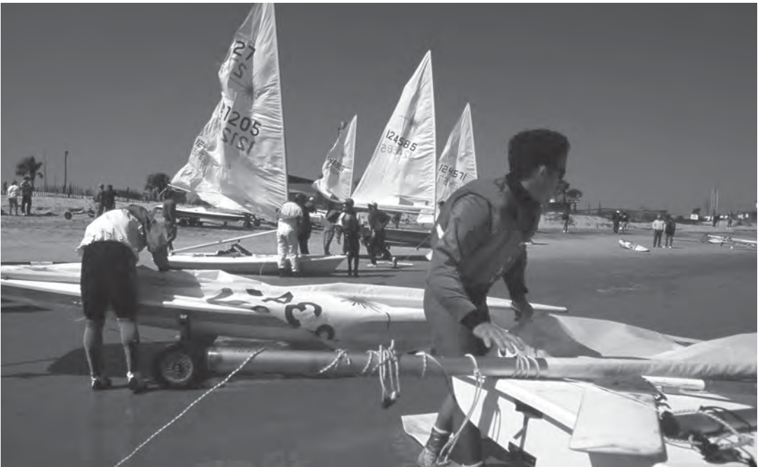
This page and following: Photographs and site plan from the Olympic sailing events held on Tybee Island during the 1996 Summer Olympics, acquired through collection swap with AHC (see p. 399). New acquisitions.