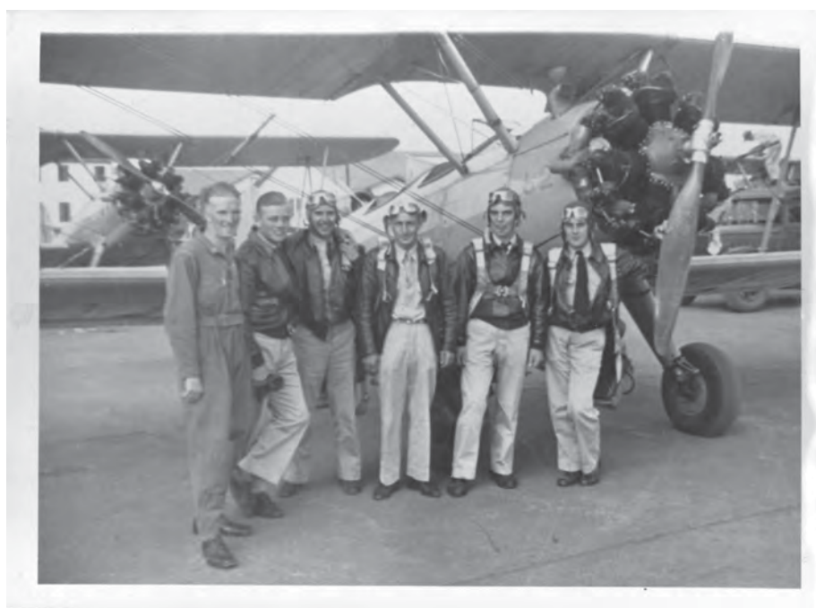
Two images of a collection of 113 documenting the training of Royal Air Force (RAF) pilots at Cochran Field in Macon, Georgia, 1942, during World War II. New acquisitions.