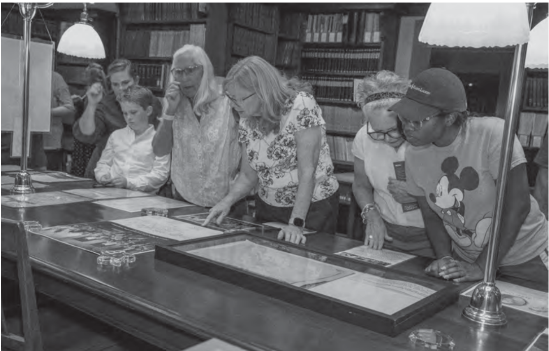
On September 17, 2025, GHS hosted a public viewing of a rare draft copy of the US Constitution and other unique artifacts and documents from the collection to commemorate Constitution Day and the 250th anniversary of the founding of the United States.

I look forward to next year and celebrating the 250th anniversary of the United States with you!