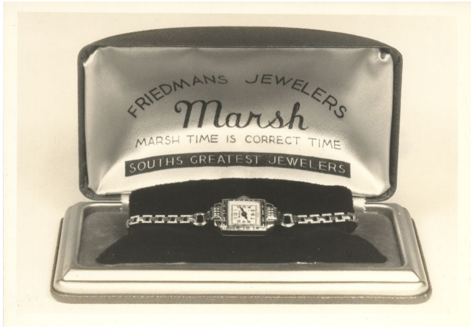
"Friedman Jewelers Ad, Savannah, Ga.," 1939.