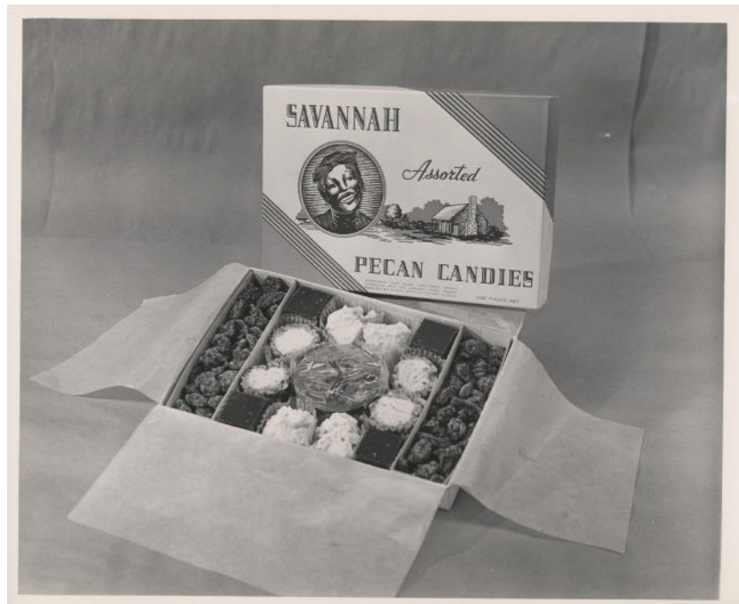
“Savannah Benne Candy Co. Ad, Savannah, Ga.,” 1948.