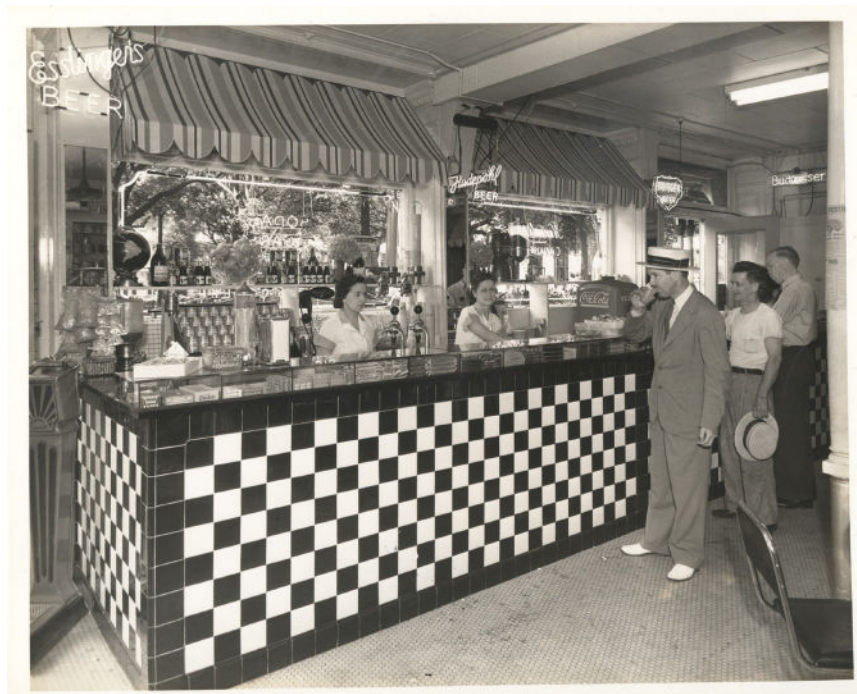
“17 Bull Street, Savannah, Ga.,” 1940.