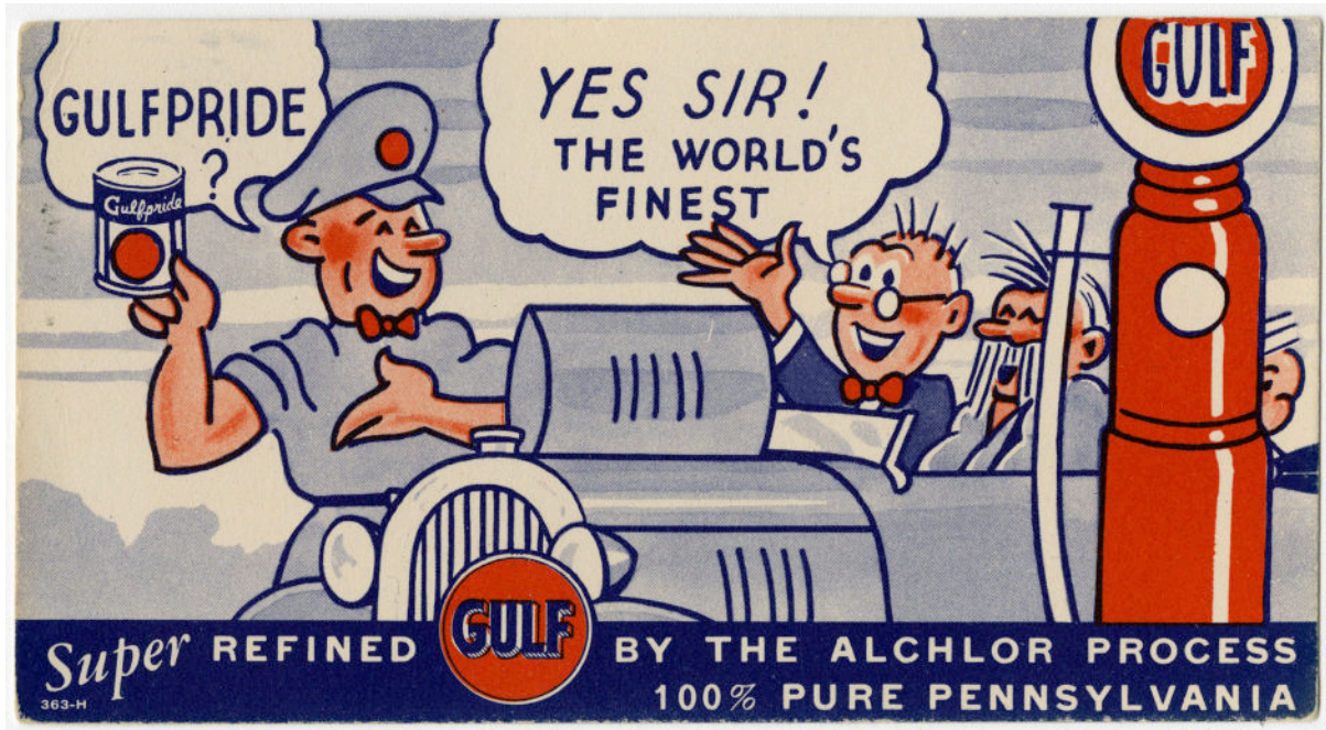
"Blotter," 1945.