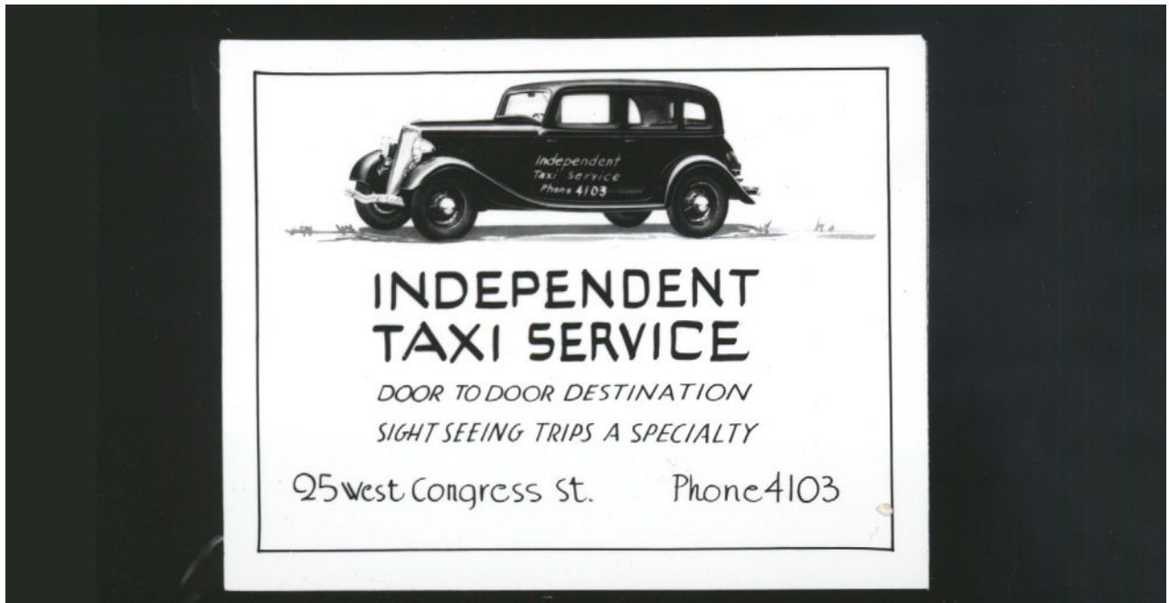
"Independent Taxi Service Ad, Savannah, Ga.," 1934.