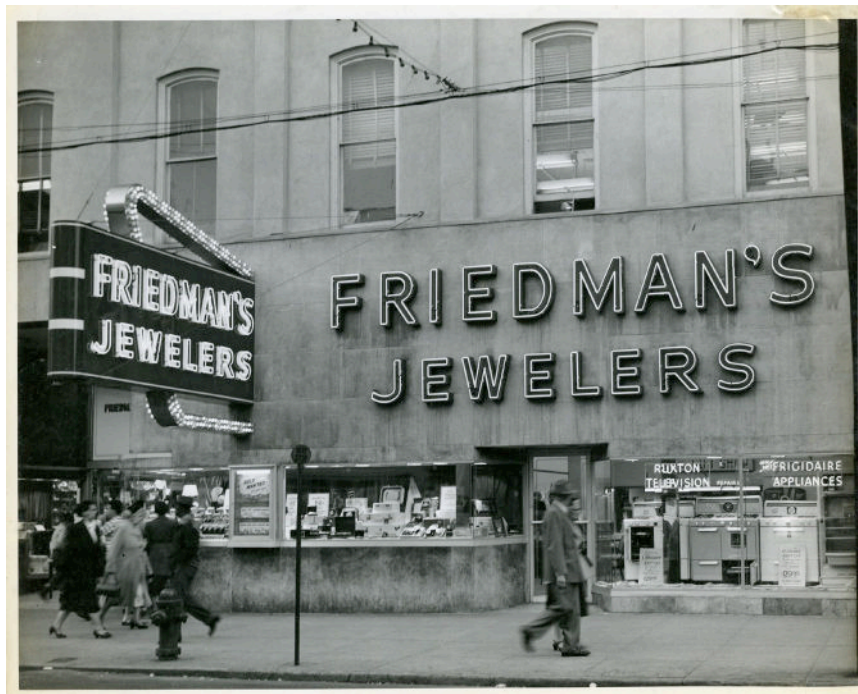
"Friedman's Jewelers," 1954.