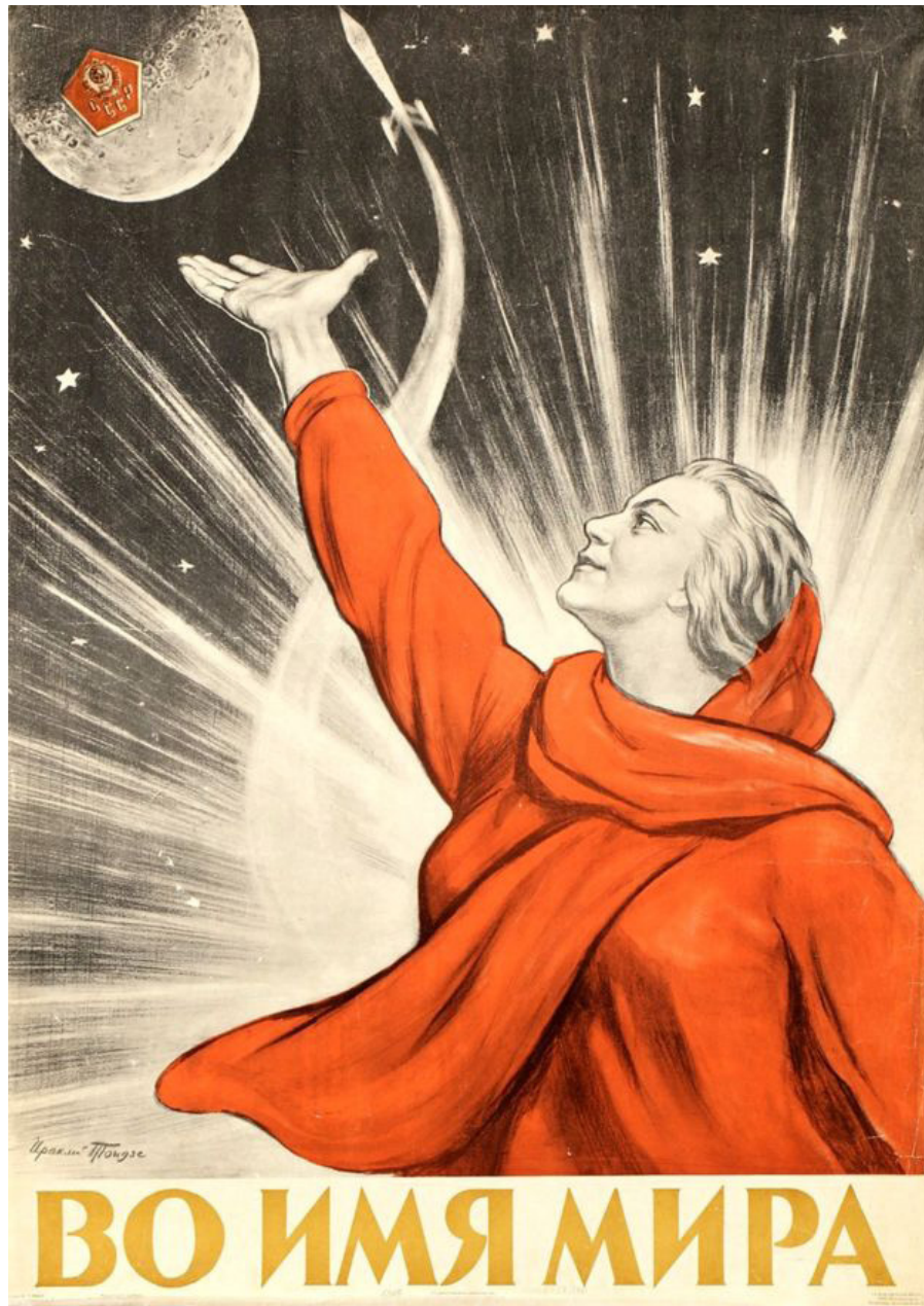
Irakli Toidze, "In the Name of Peace," Soviet space travel and support for peace. From the Museum of Cosmonautics, Moscow.

Suggested pieces of propaganda to be assessed: