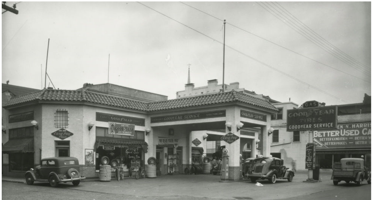
"241 Drayton Street, Savannah, Ga.," 1938.