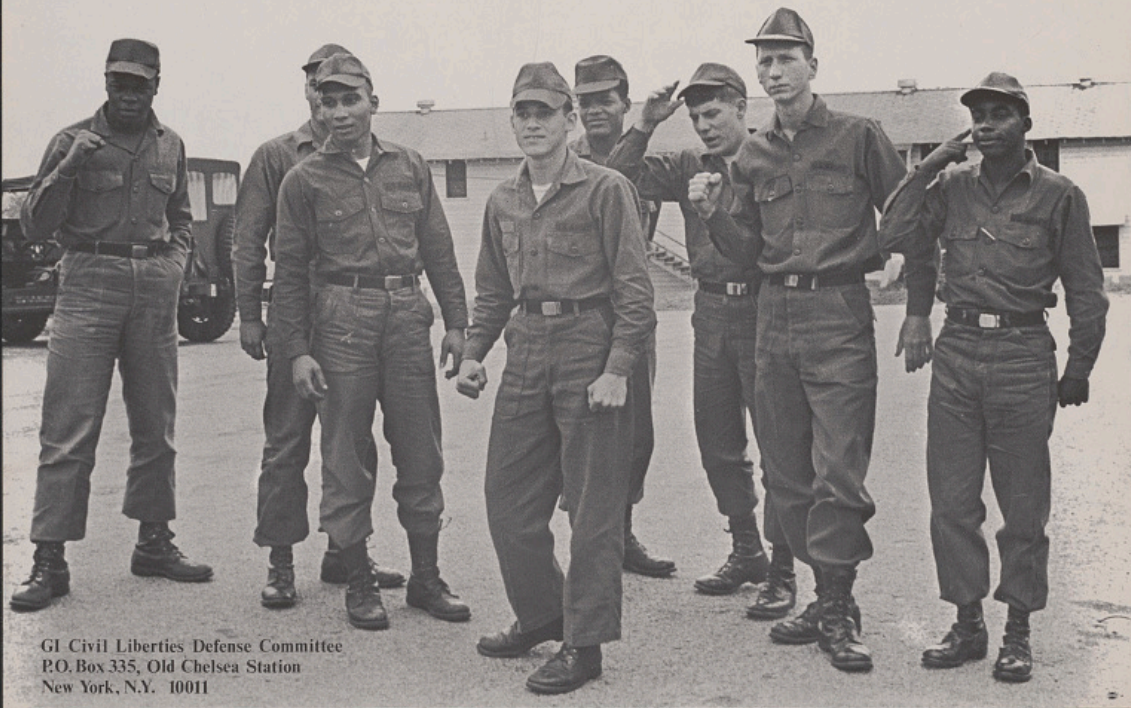
GI Civil Liberties Defense Committee, Sponsor/Advertiser. GIs united against the war, Ft. Jackson. Fighting men. South Carolina United States Fort Jackson, 1969. [New York, N.Y.: GI Civil Liberties Defense Committee] Photograph. Library of Congress.