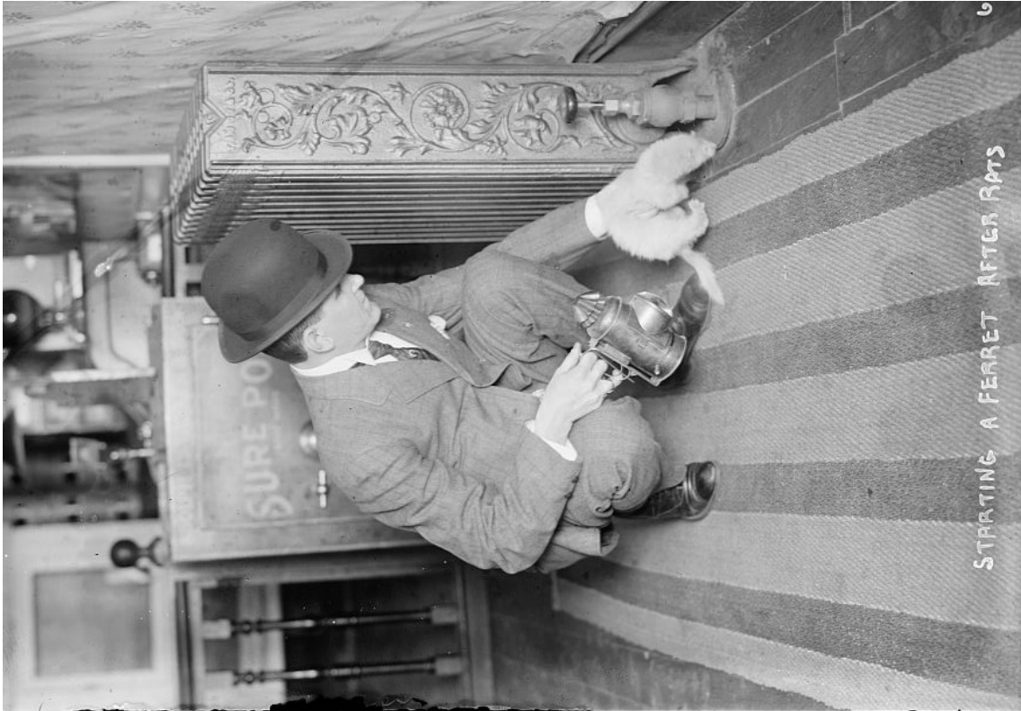
Bain News Service, Publisher. Starting a Ferret After Rats, undated. Photograph. Library of Congress.