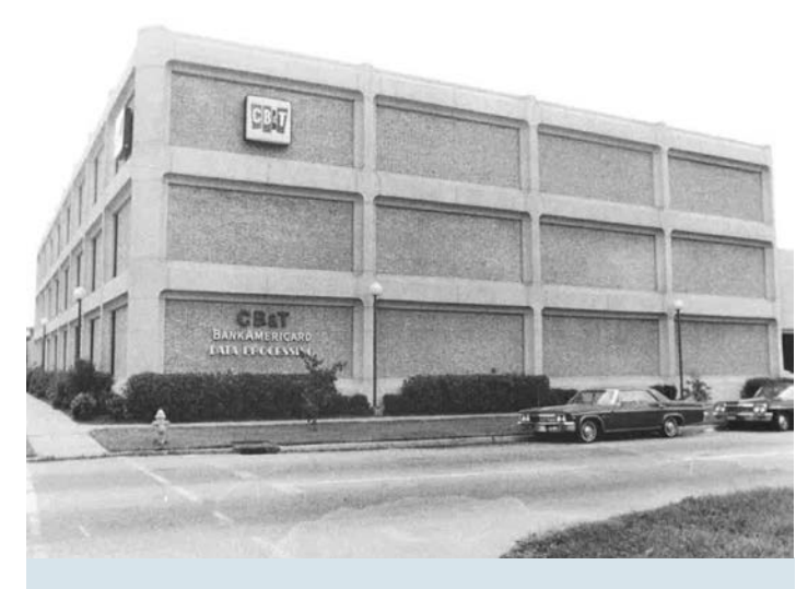
CR&T's data processing building later became the headquarers of Total System Services, Inc.

offering charge cards before BankAmericard (later Visa) and Master Charge (later MasterCard) became national players in the industry. In 1974 the company began processing credit cards for other banks. This division later became TSYS (Total System Services, Inc.).