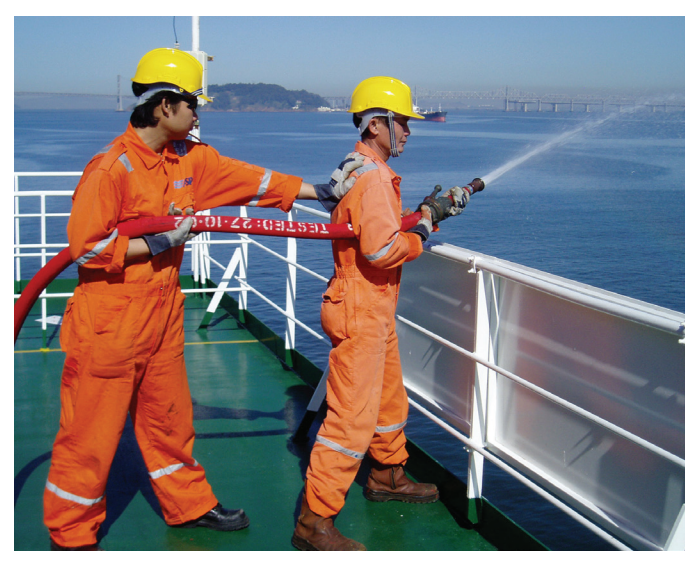
Compliance Drill. Colonial Group, Inc.

Located also at the port of Savannah, the Savannah Yacht Center refinishes and repairs some of the world's largest yachts. The center is capable of handling yachts up to 400 feet in length, and its shiplift rail can transfer a ship weighing up to 3,240 tons.