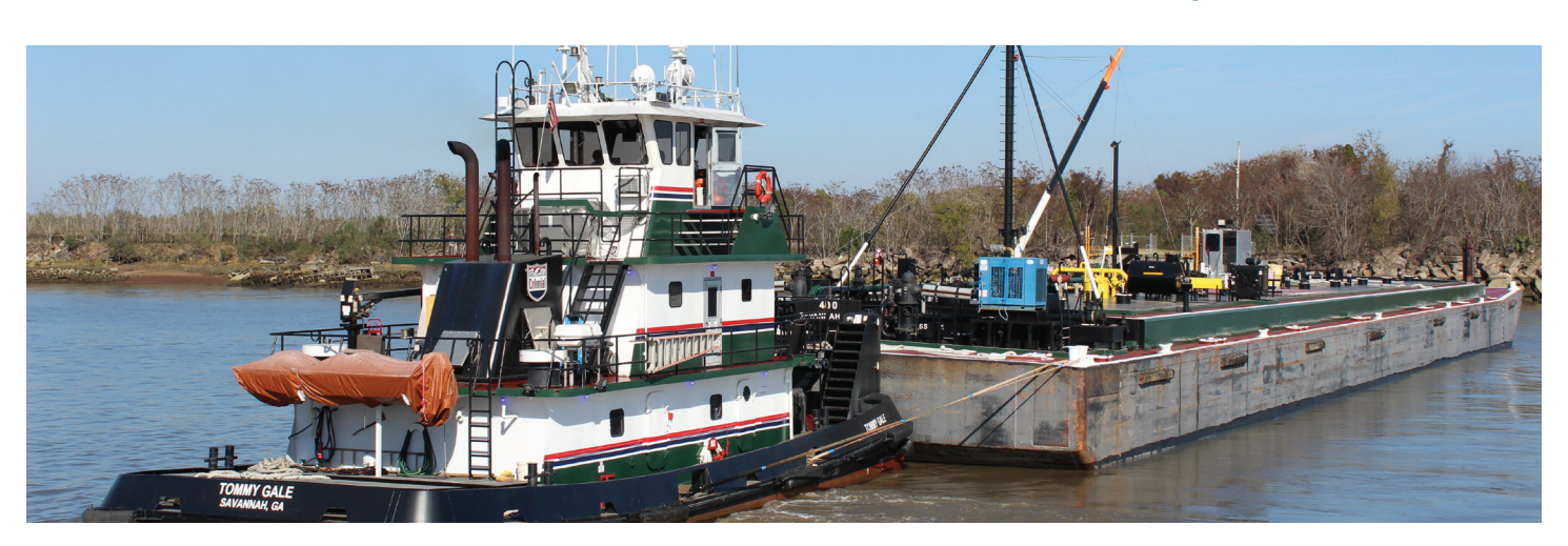
Top: Colonial Oil Transport Delivery to Enmarket. Bottom: Tug Tommy Gale and Barge. Colonial Group, Inc.

business, supplying fuel to vessels navigating in and out of the port. Colonial's first towing company was established in 1951 when Colonial Oil Company founded Chatham Towing Company of Savannah. The company expanded its towing operation in 2002 with the acquisition of another towing business in Jacksonville, FL, forming Colonial Towing. In the years following, environmental regulations became stricter. As a result, Colonial sold its marine fuel oil business and towing companies in 2013, but later reinstated the Colonial Towing name in 2019 and opened for business in 2020. The company utilizes two tugs and three barges in Savannah, GA, and Charleston, SC. The company also provides inland towing and barge service from Morehead City, NC, to Cape Canaveral, FL, along the intracoastal waterway.