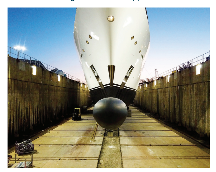
Yacht in Graving Dock. Colonial Group, Inc.