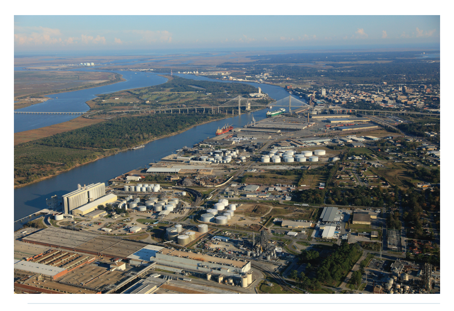
Aerial View of Terminals 1 & 2, 2017. Colonial Group, Inc.

2020: Aqua Smart, Inc. acquisition expands operations into the water treatment industry.