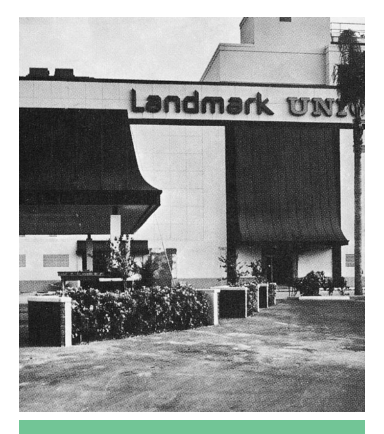
Top: Landmark Union Trust Bank of St. Petersburg, Florida. Bottom: The manufacturing of a Sun Bank credit card.

From its onset, TSYS was a forerunner in the credit card processing industry. The first bank to outsource its credit card payment processing to TSYS was Landmark Union Trust Bank of St. Petersburg, Florida in 1974. This proved to be a ground-breaking event for processing financial payments and accessing account data electronically. The Landmark team initially sought to purchase software from TSYS, but that guickly changed over a casual dinner meeting in Columbus. Landmark desired quicker, more efficient payment processing and TSYS offered a revolutionary solution. At the time, credit card payments were processed manually by sending paper receipts back and forth through the mail. This process was slow and inefficient. TSYS designed a system that successfully transitioned Landmark's paper process to an electronic one. By 1979, TSYS had landed another major processing agreement with Sun Bank of Orlando, Florida (currently SunTrust Bank) consisting of more than 250,000 accounts. But, it was TSYS' relationship with Michigan National Bank (now a part of Bank of America) in 1985 that put TSYS on the FinTech map. TSYS successfully converted over 1 million Michigan National accounts to the TSYS processing system, giving TSYS a reputation of reliability and success.