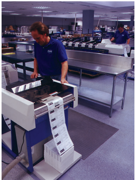
Left: TSYS network control center. Right: TSYS employees printing credit card receipts for a manual credit card machine.