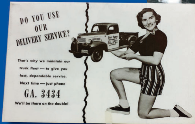
Above: 1950s brochure for delivery service. Right: Historic NAPA store. Below: 1950s NAPA desktop sign