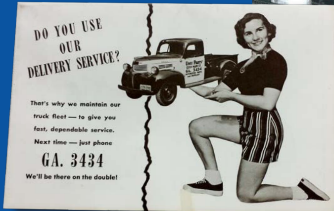
Above: 1950s brochure for delivery service. Right: Historic NAPA store. Below: 1950s NAPA desktop sign