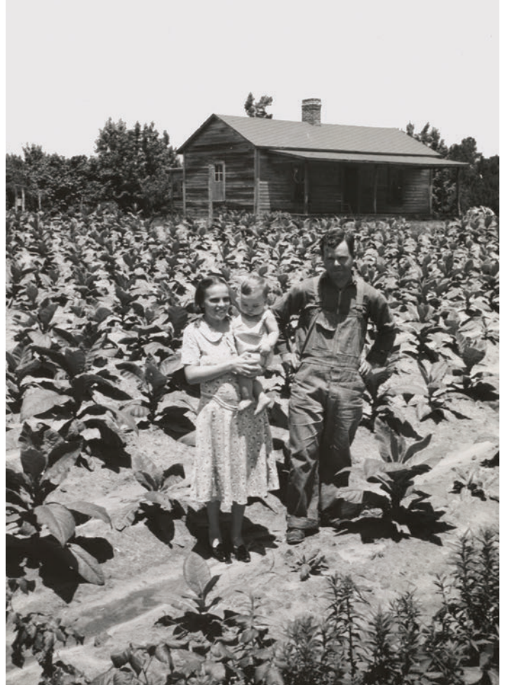
"Sharecropper with wife and child in their tobacco field," 1939.

farmers turned to newly discovered guano from Peru. Peruvian guano was exceptionally high in nutrients and became wildly popular with southern farmers. Prior to the Civil War importation of guano reached its peak in