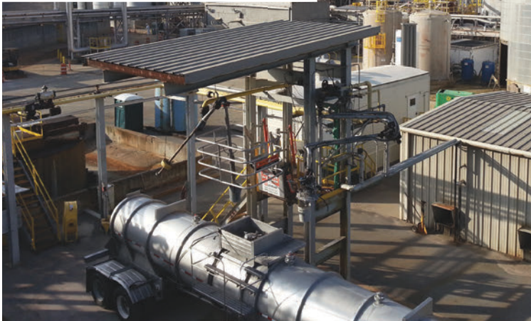
Upper left: Southern States Chemical - Wilmington, North Carolina. Upper right: SeaGate Terminals - Chesapeake, Virginia. Lower left: SeaGate Terminals - Savannah, Georgia. Lower right: Southern States Chemical - Augusta, Georgia. Center: Dulany Industries - Savannah, Georgia.