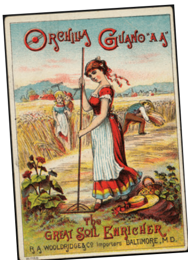
Advertising card for Orchilla Guano, ca. 1870-1900.

For much of the nineteenth century, Baltimore was the largest and most southern port of entry for Peruvian guano into the United States. Transporting guano from Baltimore to locations across the South further increased the cost. Antebellum-era cash-poor farmers were forced to buy guano on credit, thrusting them deeper into debt. Southern farmers were further hurt when northern companies halted sales of guano during the Civil War. By the time sales resumed in the late 1860s, the supply of Peruvian guano was running low and was all but exhausted by 1870.