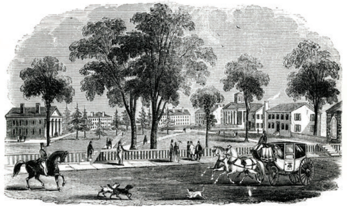
University of Georgia, 1850