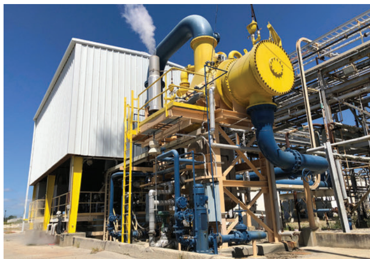
SeaPoint Steam Turbine and Generator

The complex also includes one mile of deep-water access in the Port of Savannah, the nation's third-busiest, and a recycled steam-power generator that produces 2.5 million watts of power which makes the complex " electricity neutral. " The company even has the ability to sell the steam byproducts to other companies, eliminating the need for them to burn natural gas to produce their own steam.