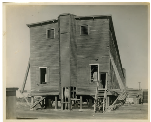
Southern States Phosphate Company, 1943.

only eleven of Savannah's original fourteen fertilizer companies were left in existence, and by 1985 only Southern States Phosphate and Fertilizer Company remained. Run by the Dulany family since 1940, the company continued to produce sulfuric acid as well as superphosphate and ammoniated fertilizers until it ceased fertilizer production and changed its name to Dulany Industries in March of 2000.