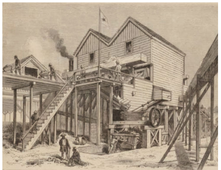
Illustration of the phosphate industry in Charleston, SC, from Frank Leslie's Illustrated Newspaper, June 30, 1877

From 1868 to 1899, this area furnished 90 percent of the world's supply of phosphate rock and provided materials for phosphoric acids needed to make fertilizer. By the end of the nineteenth century, Georgia led the nation in the consumption of chemical fertilizers. By 1887, there were 139 fertilizer companies doing business in Georgia, and nineteen fertilizer factories in the state.