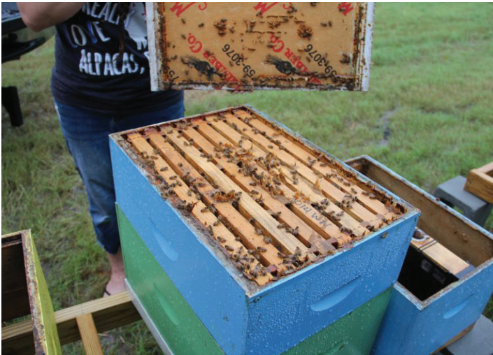
SeaPoint Honey Bees

SeaPoint Industrial Terminal Complex is a 755-acre multi-use industrial complex in Savannah with the goal of attracting synergistic companies to one location to reduce the energy and environmental impact of transporting goods across short distances. “A company that locates on our site can benefit from synergies created by river access, co-located industries, shared services, and green energy, thereby creating a truly sustainable industrial terminal complex.”