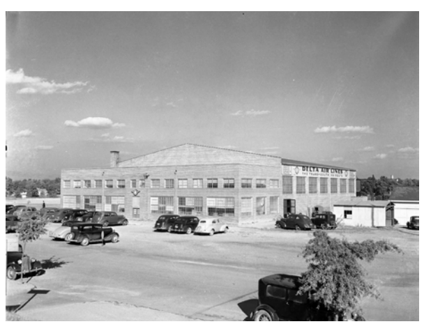
Delta Headquarters in Atlanta, 1941.

During WWII the airport was declared an airbase by the U.S. Government. The airport doubled in size during WWII. Delta also contributed to the war effort. Delta's headquarters was named a temporary Army Air Corps Modification Base. Delta employees worked in partnership with the Bell Aircraft plant in Marietta to modify airplanes for use as bombers. Delta also participated in the Airlines War Training Institute and operated cargo supply routes for the military.