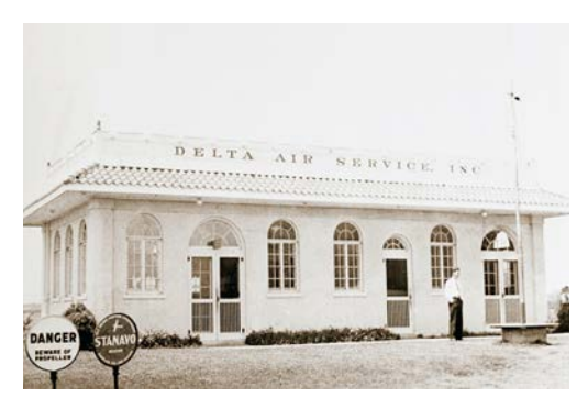
Delta Headquarters, Monroe, Louisiana, 1929.

Delta got its start in 1924 as a small crop-dusting company called Huff Daland Dusters. The crop-dusting company was originally headquartered in