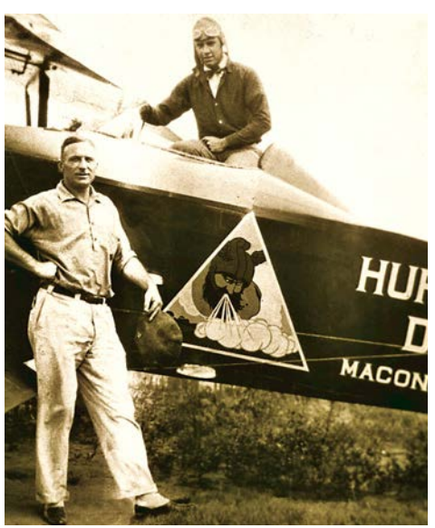
Huff Daland Crop Duster.

Today, Delta is a global corporation with nearly 80,000 employees, but it began as the first-ever commercial aerial agricultural company. In 1924, Huff Daland Dusters crop-dusting operation was created to help solve a very serious problem affecting America's farmers - the boll weevil.