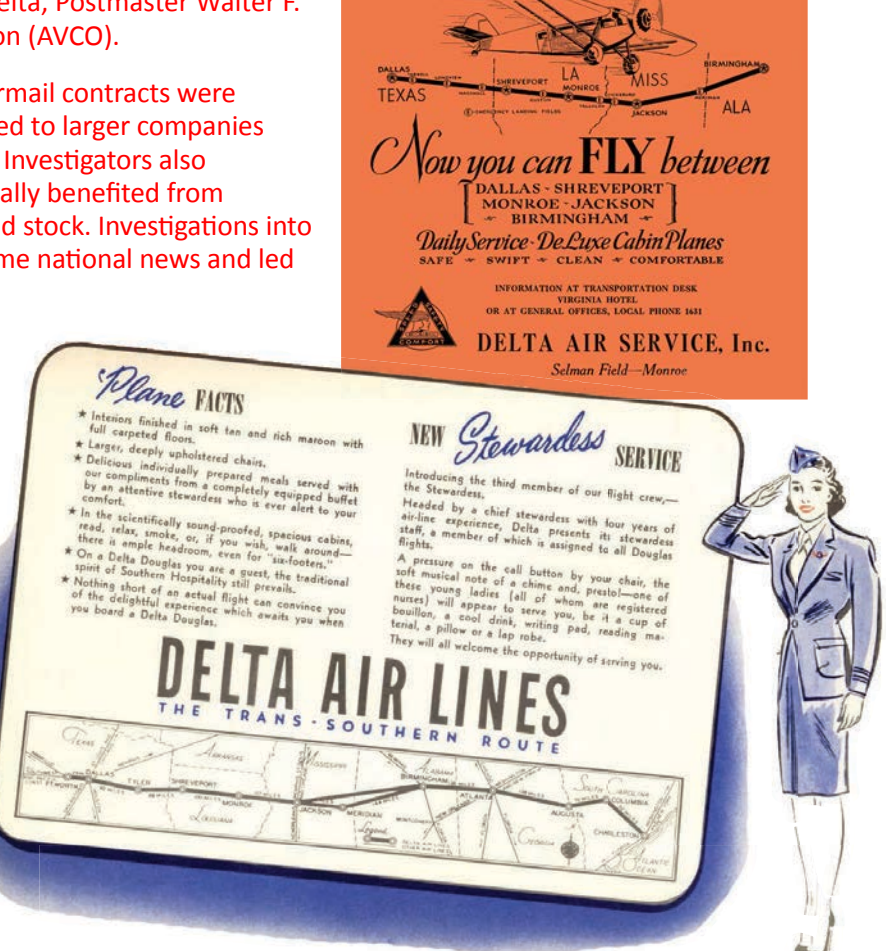
Top right: 1929 advertisement for Delta passenger flights from Dallas to Birmingham. Bottom right: Excerpt from 1940 brochure about flying Delta's Trans-Southern Route on its new fleet of Douglas airliners.

Under the new rules, established airlines that could meet new regulations did better than new companies. Winning and successfully managing Route 24 from Charleston, South Carolina to Fort Worth, Texas paved the way for Delta to get route extensions and new routes from the CAB.