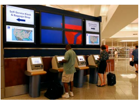
Delta kiosks in Hartsfield-Jackson Airport.

In 2000, Hartsfield-Jackson became the busiest airport in the world for passenger service. Atlanta would probably not have earned that distinction if it did not have the world's busiest airline hub run by Delta.