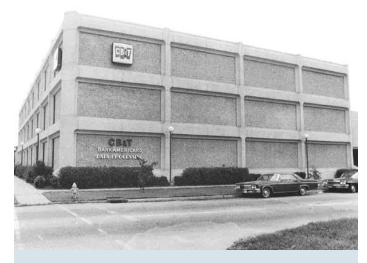
CR&T's data processing building later became the headquarers of Total System Services, Inc.

offering charge cards before BankAmericard (later Visa) and Master Charge (later MasterCard) became national players in the industry. In 1974 the company began processing credit cards for other banks. This division later became TSYS (Total System Services, Inc.).