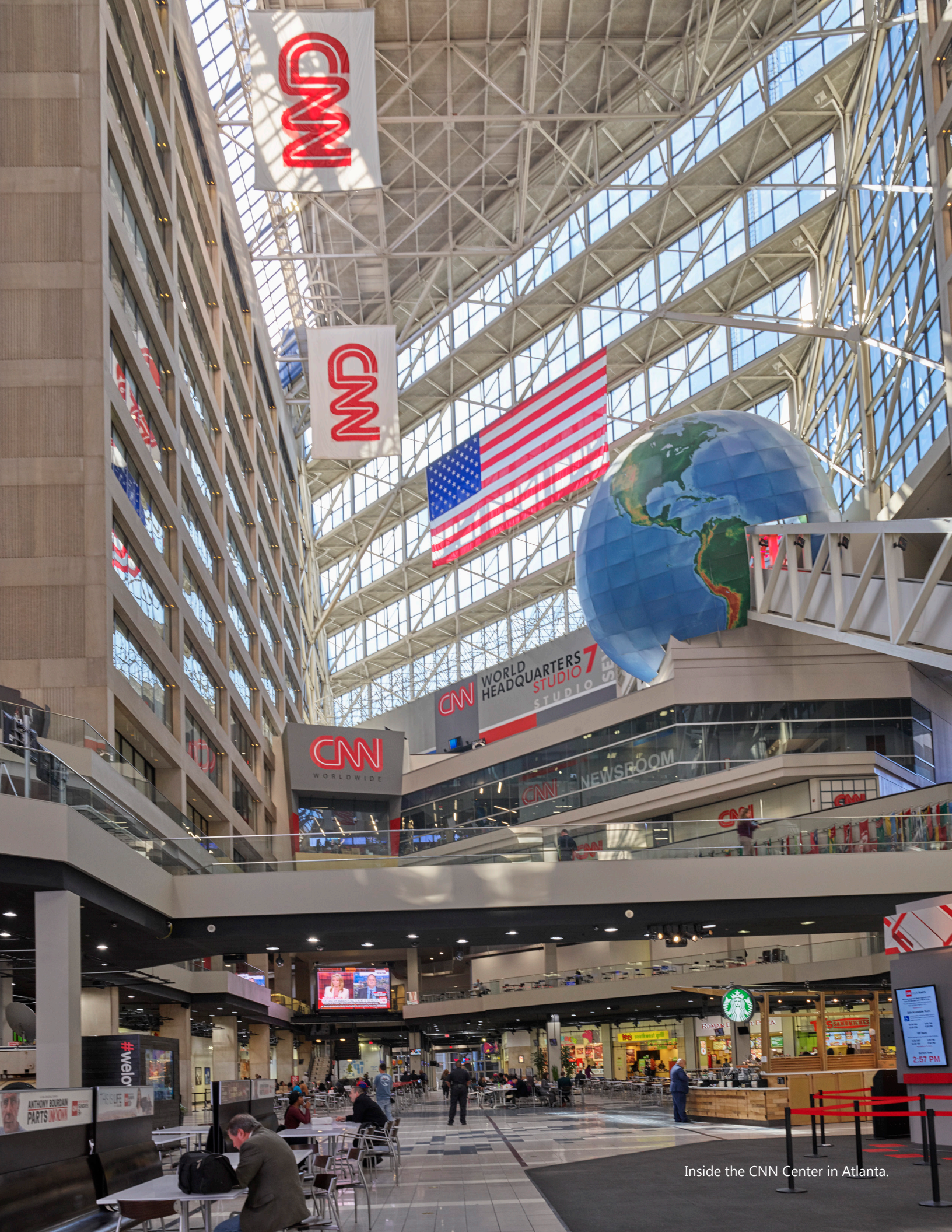
Inside the CNN Center in Atlanta.