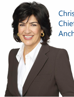
Christiane Amanpour, Chief International Anchor for CNN