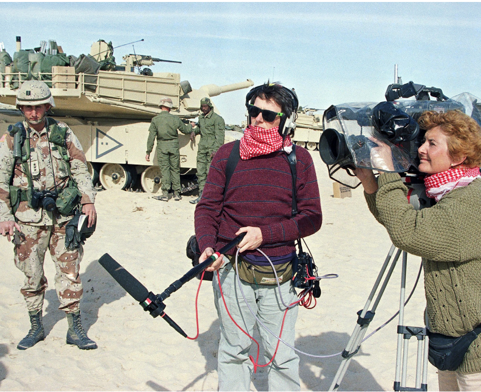
Left: CNN's live coverage of the Gulf War. Right: President Ronald Reagan talks with CNN's Bernard Shaw and Ted Turner.