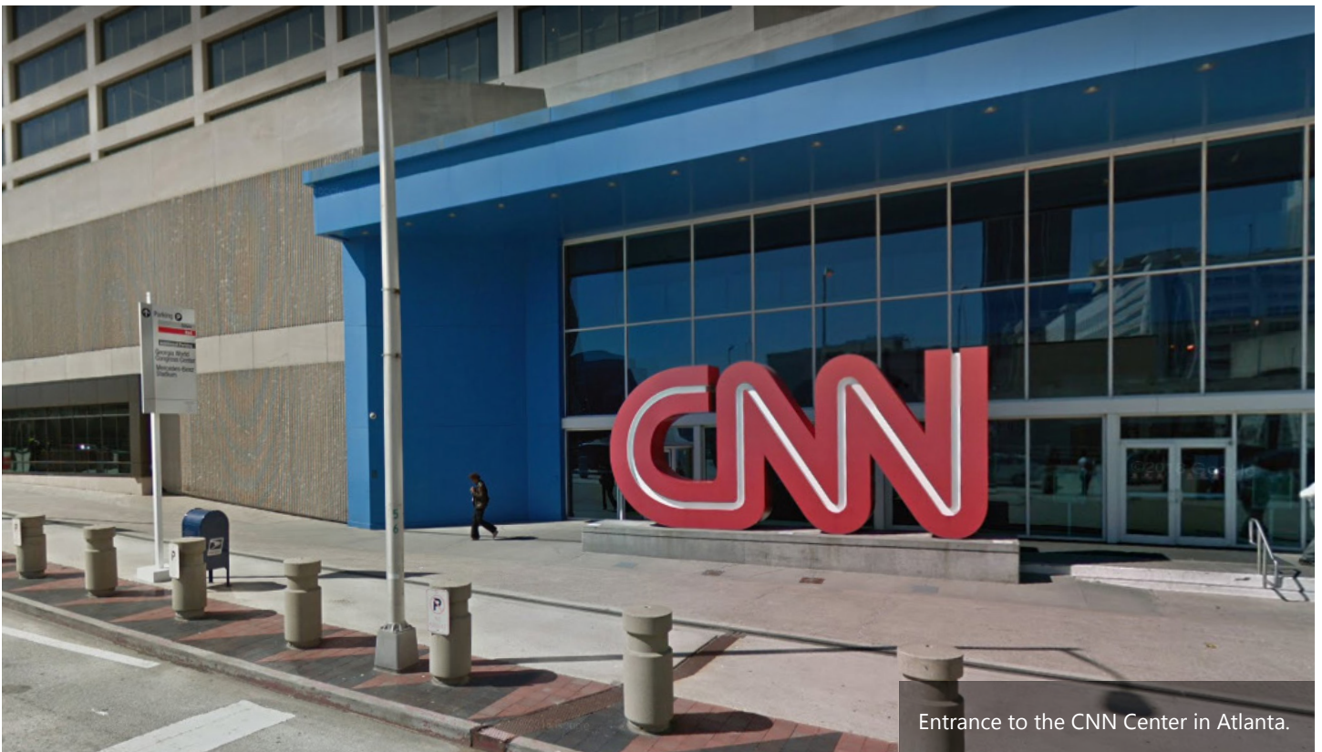
Entrance to the CNN Center in Atlanta.

Many were skeptical of Turner's idea for a specialized television channel. The public asked: Was there a viable, profitable market for such a channel? Could it compete with competitors like ABC, CBS and NBC? Could it compete on a budget that was only a fragment of its competitors? Turner believed that many Americans did not want to wait until the evening to receive news and were interested in specialized networks, so he was willing to take the risk to try.