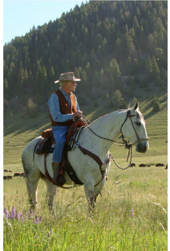
Ted Turner on horseback at his ranch.

With determination, Turner courageously pursued his vision for the future of television. He pushed through many risky decisions to create a television empire from Turner Broadcasting System. Despite a small budget and competition, Turner optimized the television market for CNN early on by providing only cable services. He did not make cost-effective choices with each business decision, but continued to lead the company toward profits. Today, many of his channels remain successful and popular with a worldwide audience, despite meager beginnings in Georgia.