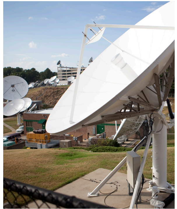
Left: Ted Turner with WTCG camera . Right: TBS satellite dish.

Alabama and Florida. New cable channels, as well as UHF channels, could come through the cable hookup and have equal picture quality. Most of Turner's competitors, such as ABC, NBC, and CBS, only used UHF, making them noticeably more expensive and less accessible, especially for more rural states such as Georgia.