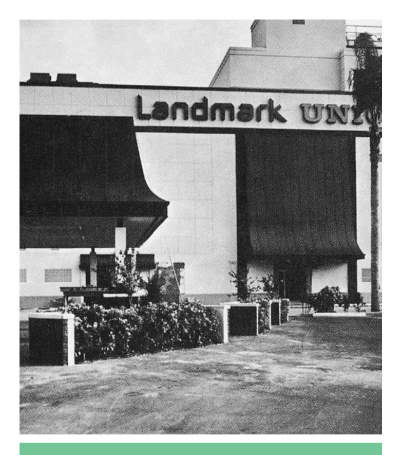
Top: Landmark Union Trust Bank of St. Petersburg, Florida. Bottom: The manufacturing of a Sun Bank credit card.

From its onset, TSYS was a forerunner in the credit card processing industry. The first bank to outsource its credit card payment processing to TSYS was Landmark Union Trust Bank of St. Petersburg, Florida in 1974. This proved to be a ground-breaking event for processing financial payments and accessing account data electronically. The Landmark team initially sought to purchase software from TSYS, but that guickly changed over a casual dinner meeting in Columbus. Landmark desired quicker, more efficient payment processing and TSYS offered a revolutionary solution. At the time, credit card payments were processed manually by sending paper receipts back and forth through the mail. This process was slow and inefficient. TSYS designed a system that successfully transitioned Landmark's paper process to an electronic one. By 1979, TSYS had landed another major processing agreement with Sun Bank of Orlando, Florida (currently SunTrust Bank) consisting of more than 250,000 accounts. But, it was TSYS' relationship with Michigan National Bank (now a part of Bank of America) in 1985 that put TSYS on the FinTech map. TSYS successfully converted over 1 million Michigan National accounts to the TSYS processing system, giving TSYS a reputation of reliability and success.