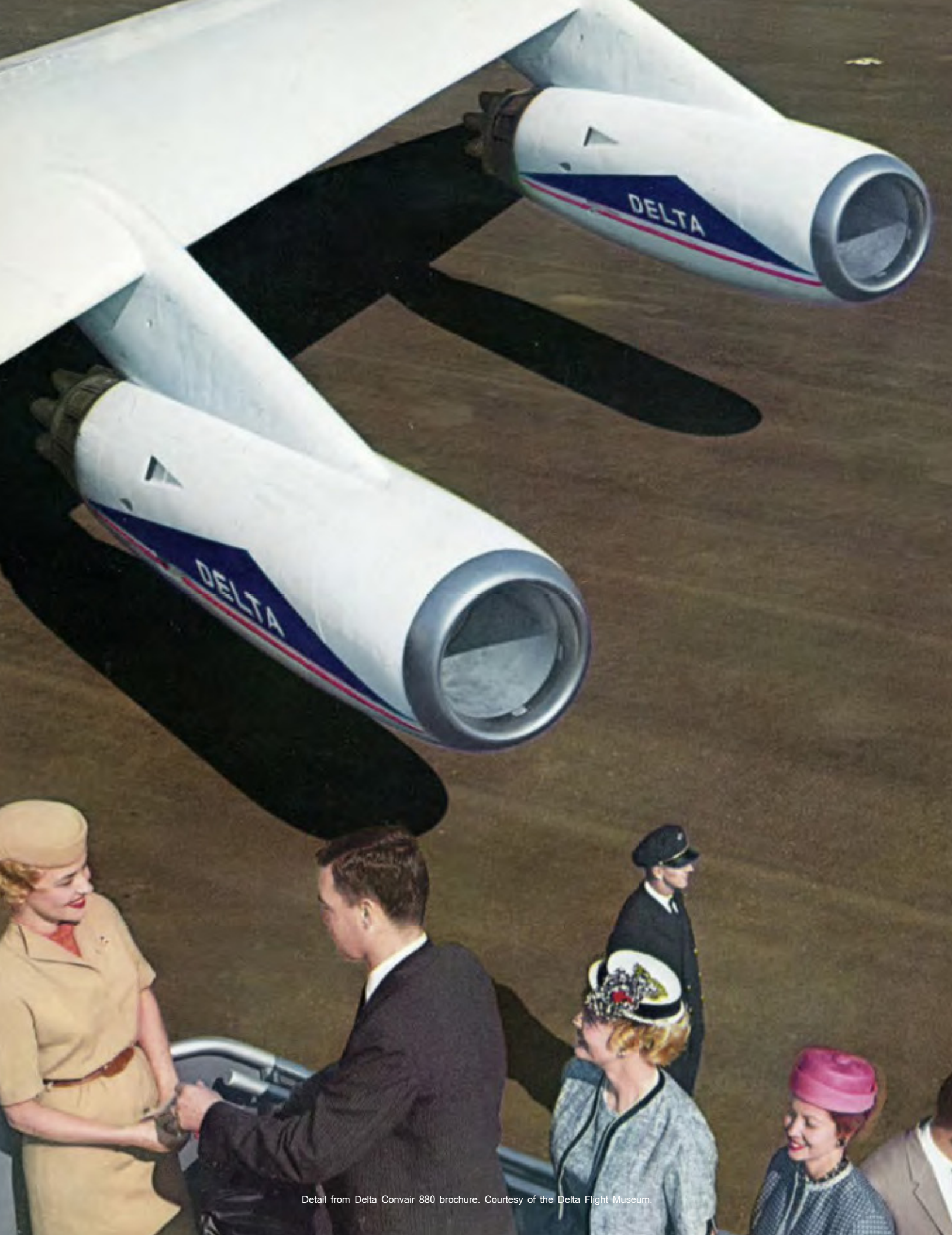
Detail from Delta Convair 880 brochure.