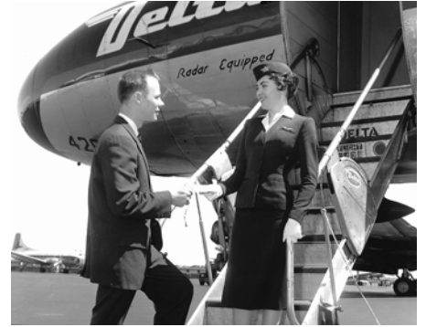
Delta Flight Attendant, 1957.

Delta is a global business, but it chooses to keep its headquarters in Atlanta. Today, Delta has more than 30,000 employees in Atlanta alone. In fact, Delta still uses some of the original buildings from the 1940s for its operations. The impact of Delta's decision to move its headquarters to Atlanta in 1941 is a great case study in the symbiotic relationship between Georgia and the businesses that choose to call Georgia home.