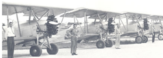
The Delta Dusting Division had about 20 crop dusting aircraft in 1935.

In the coming decades, Delta would grow even larger to become a global carrier. In 1959, Delta successfully transitioned into the jet age by putting its first DC-8 jet into service. In the 1970s and 1980s, Delta