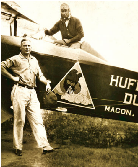
Huff Daland Crop Duster.

Today, Delta is a global corporation with nearly 80,000 employees, but it began as the first-ever commercial aerial agricultural company. In 1924, Huff Daland Dusters crop-dusting operation was created to help solve a very serious problem affecting America's farmers - the boll weevil.