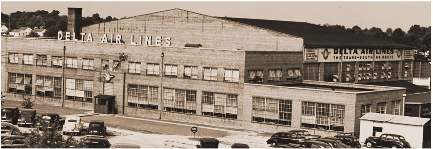
Delta Headquarters, 1943.