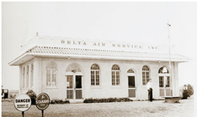
Delta Headquarters, Monroe, Louisiana, 1929.