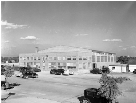
Delta Headquarters in Atlanta, 1941.

In January 1941, Delta was awarded a major route expansion. This expansion made Atlanta the center of Delta's 16-city route system. A new route from Atlanta to Cincinnati, Ohio made Atlanta even more geographically important for Delta.