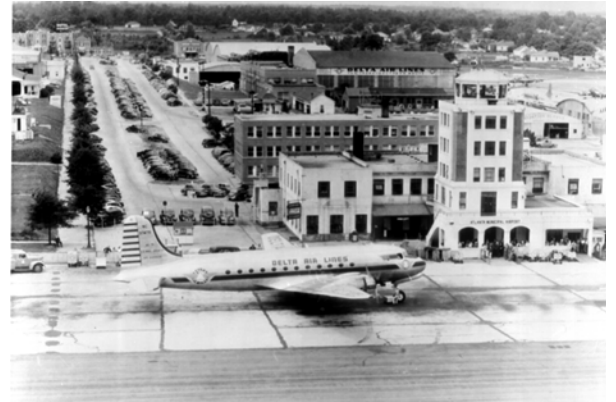
1946 Atlanta Airport.