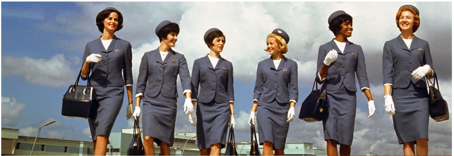
Delta Flight Attendants, 1965.