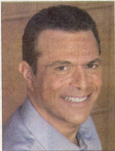
Michael Beschloss Keynote Speaker

toric squares. The program will feature greetings from Her Majesty's government and the presentation of the Georgia Historical Society's three primary awards. The keynote speaker is Michael Beschloss, NBC's presidential historian,